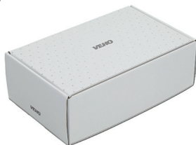
custom-branded gift box

Laser engraving on the candle glass is available upon request.