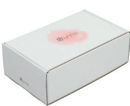
Small gift box