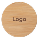
with custom logo