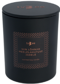
rose gold sticker