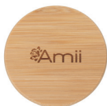
with Amii logo