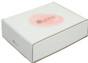
Large gift box

Custom gift sets and packaging solutions are available upon request: